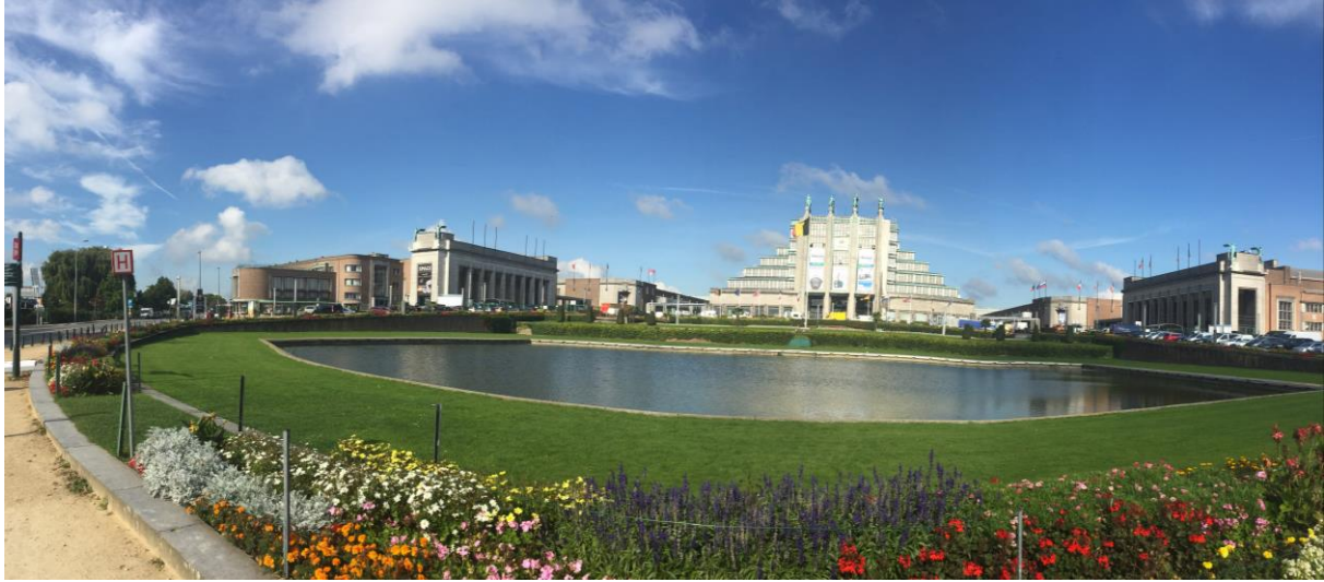
A panoramic view of the Brussels Expo, venue for this year's LabelExpo Europe event for label and package printers.